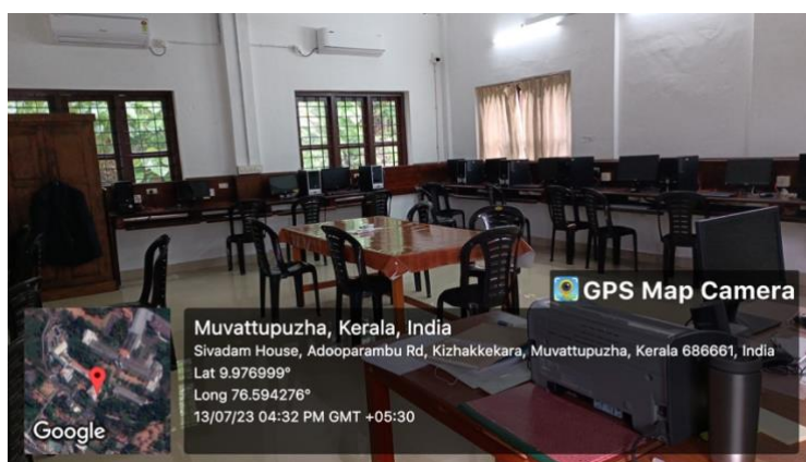
Inside area of computer lab 1