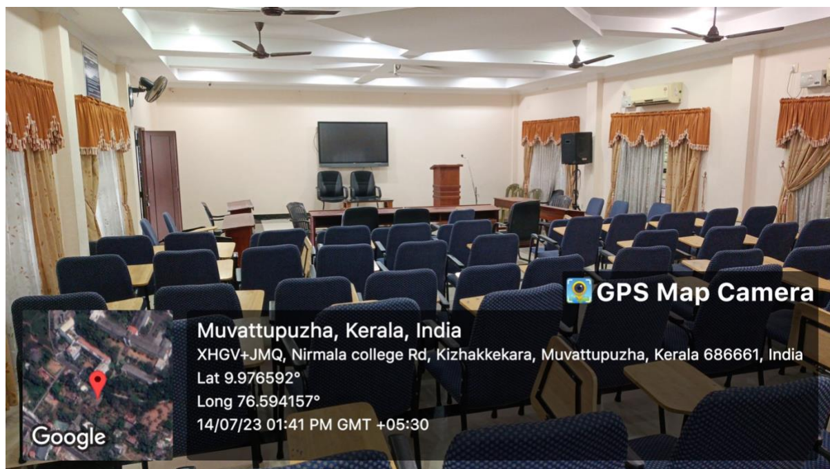
Seminar hall (SMART CLASSROOM) - Inside view