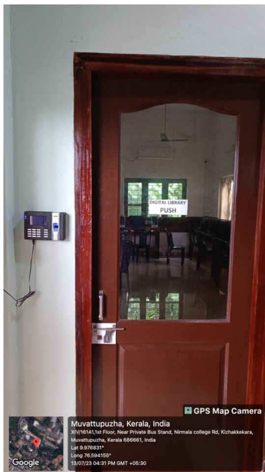
Entrance of Computer lab 1