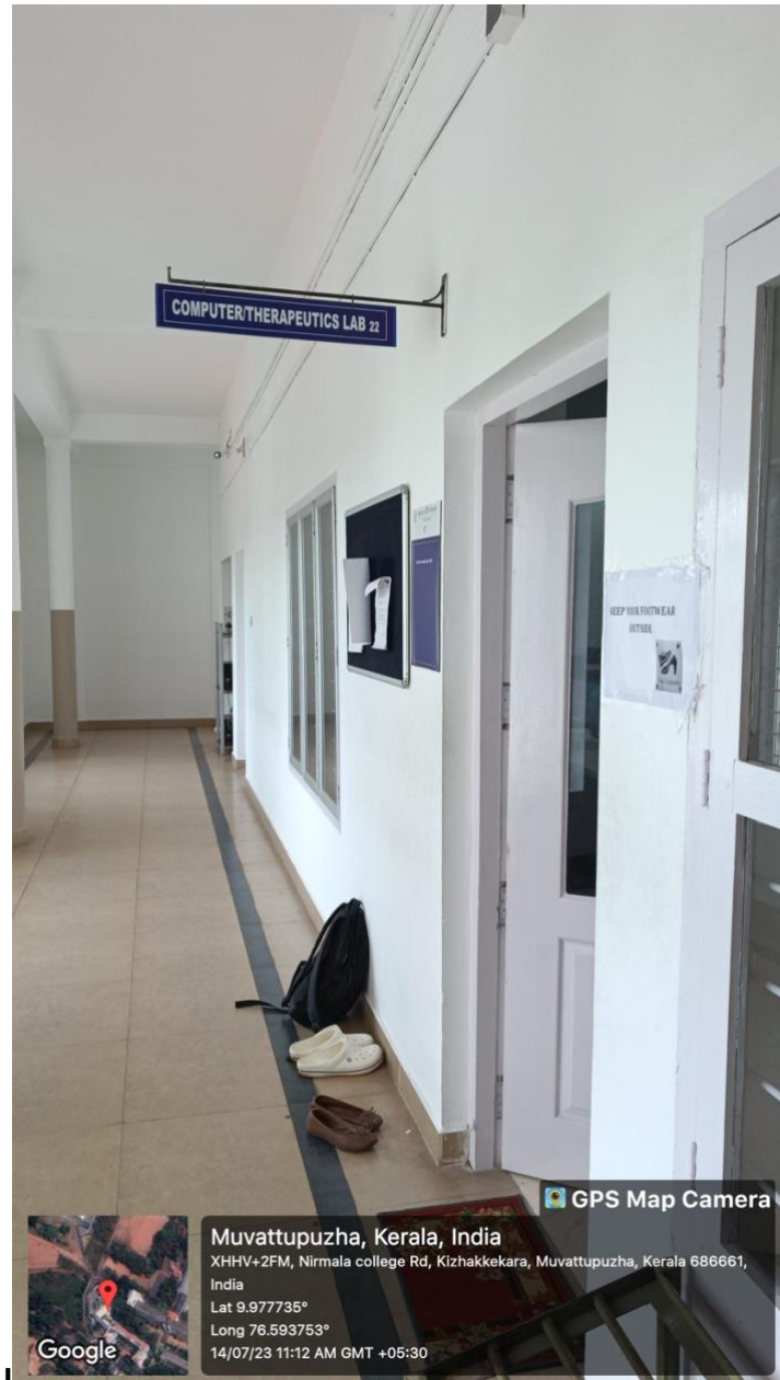
Entrance of computer lab 2