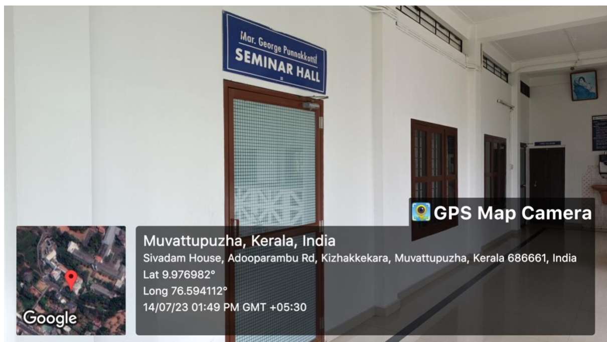
Seminar hall (SMART CLASSROOM) – Entrance