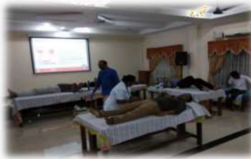
Blood donation drive