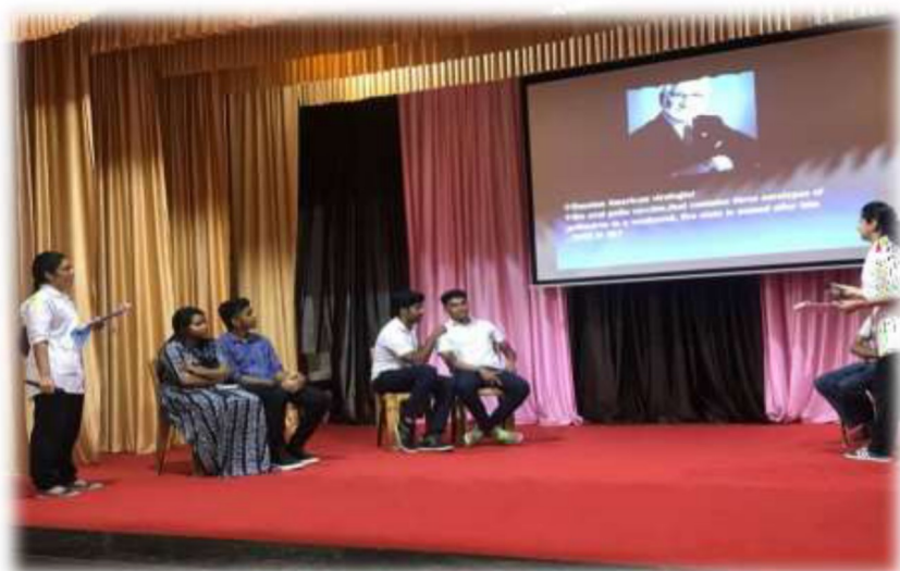
Mime on "errors of self-medication"