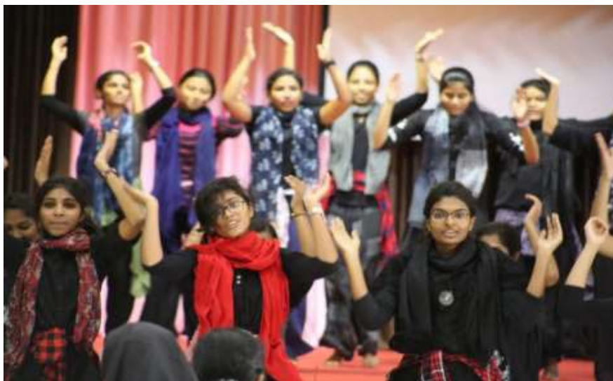
Freshers' day Dance