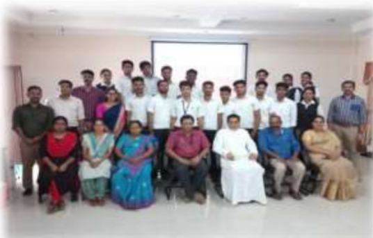
Corticate distribution (Blood donation camp)